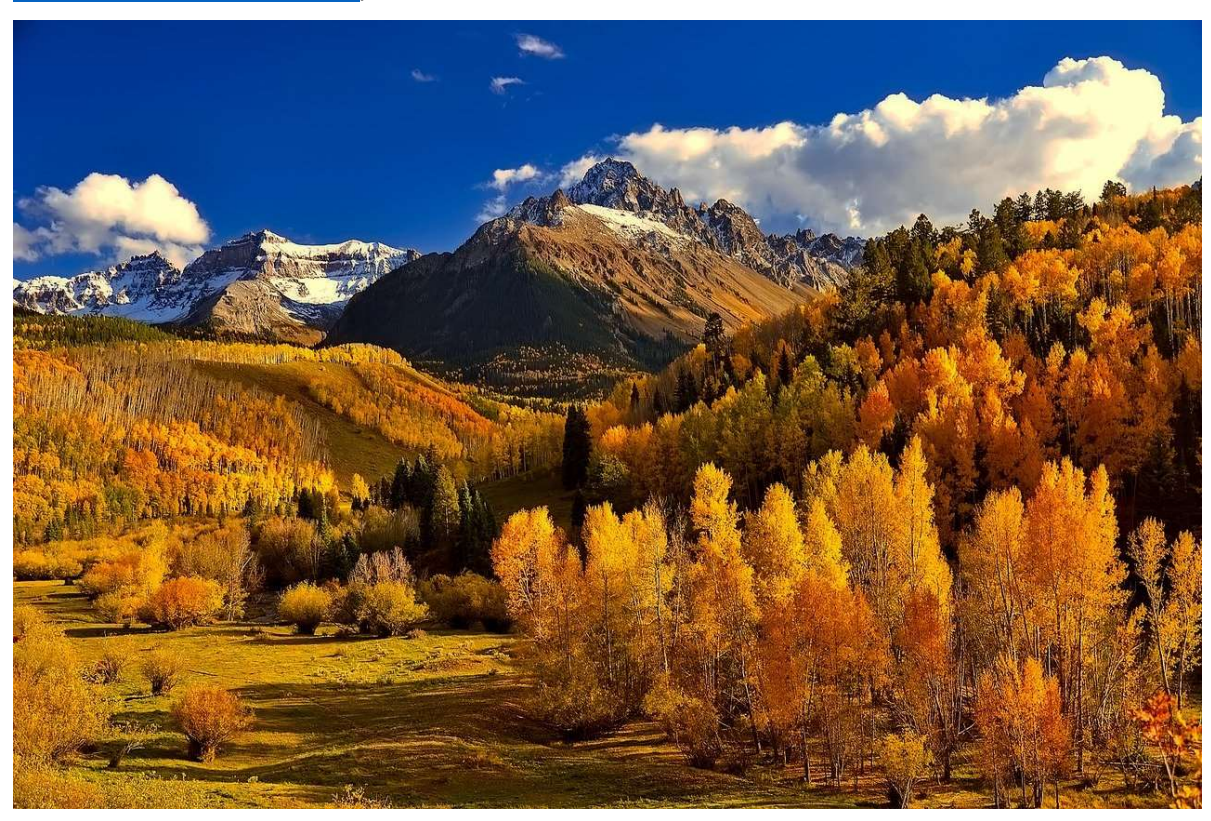
A recent point to note is the call for book chapters/proposals - Remote Sensing of African Mountains - Geospatial Tools Toward Sustainability

Another interesting site is the Mountain Research Initiative (<a href="https://mailchi.mp/mountainresearchinitiative.org/mri-july-2020-newsletter?e=85c7433ba2">https://mailchi.mp/mountainresearchinitiative.org/mri-july-2020-newsletter?e=85c7433ba2</a>).